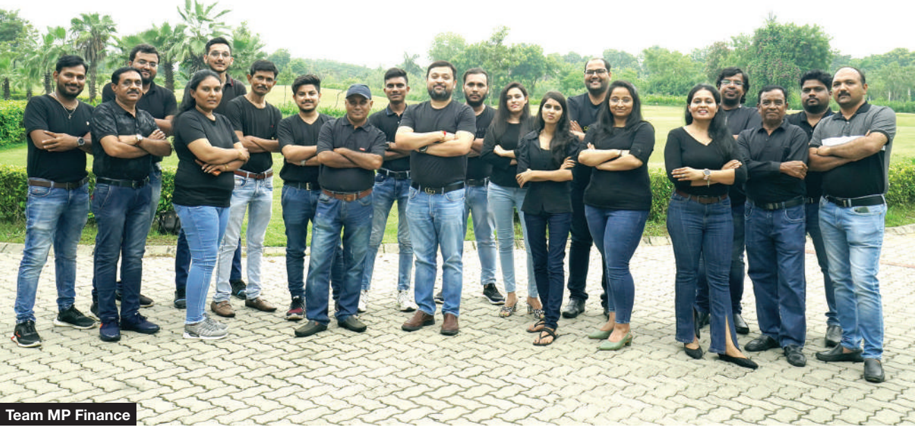
Team MP Finance