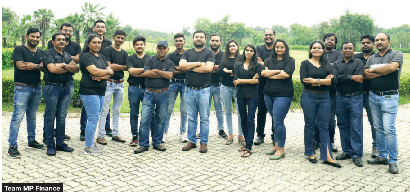
Team MP Finance