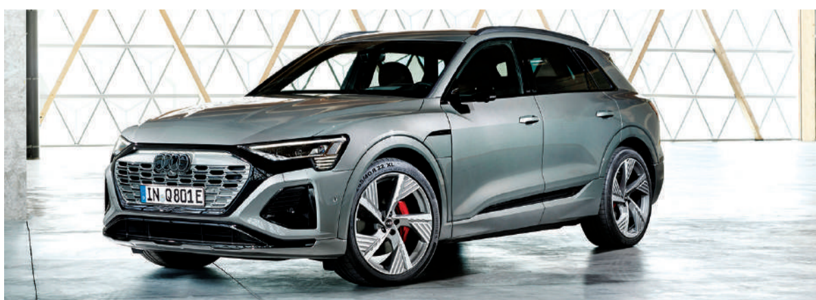
*T&C apply. Car model shown for presentation purpose only. Features, accessories, equipment may vary depending on Audi Q8 e-tron variants and may not be offer in India