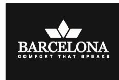
Barcelona Comfort that speaks

sive B2B app in January 2022 reflects Barcelona's dedication to organized growth in the retail sector.