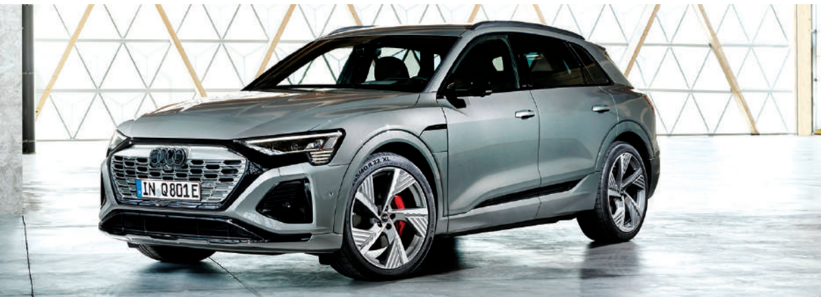
*T&C apply. Car model shown for presentation purpose only. Features, accessories, equipment may vary depending on Audi Q8 e-tron variants and may not be offer in India